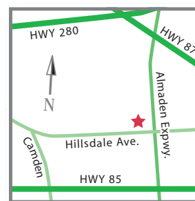
Convenient Access to Highways 280, 85, & 87